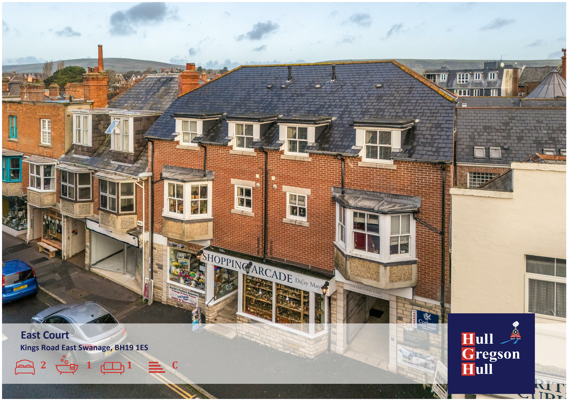
East Court Kings Road East Swanage, BH19 1ES